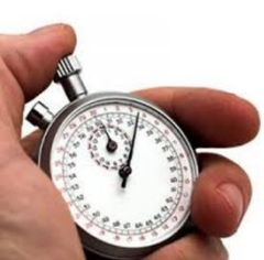
Tabla de fechas (II)